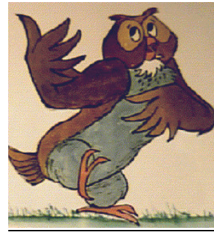
The Frontenac Times Advice Column